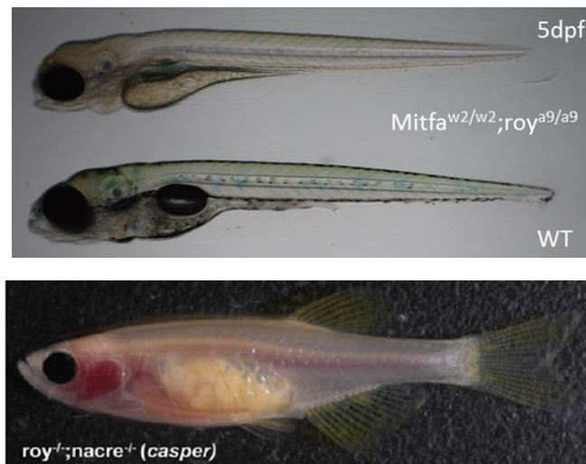
Figure. The Casper line exhibits almost transparent phenotype. The upper figure shows the lateral view of Casper embryos and wild-type embryos at 5 dpf. The lower figure shows the lateral view of Casper line at adult.